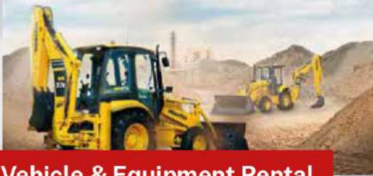
Vehicle & Equipment Rental