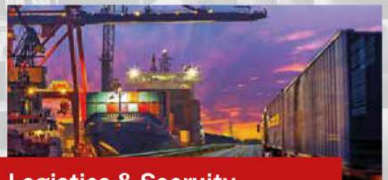
Logistics & Security