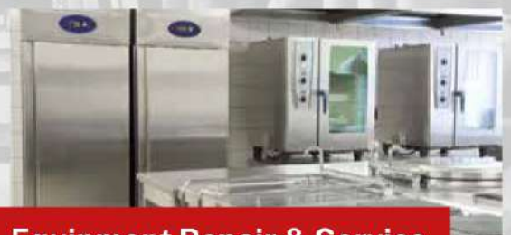
Equipment Repair & Service