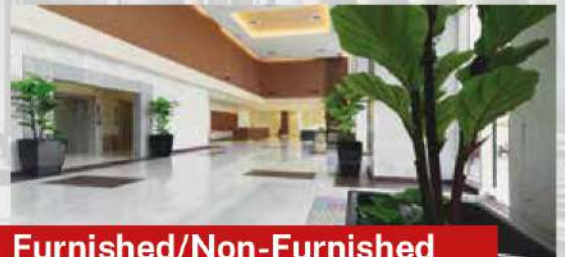
Furnished/Non-Furnished Real Estate