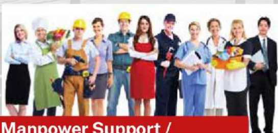
Manpower Support / Sponsorship Services