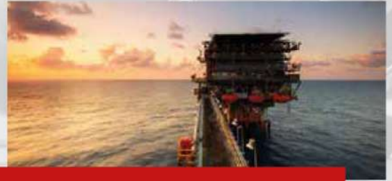
Contracting & Maintenance